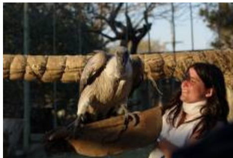
Face to face with African birds of prey

"During my six weeks in South Africa I discovered a country I didn't know before. I met a lot of extraordinary people and I saw a lot of beautiful things! Now, I have a family in South Africa too! I really enjoyed my six weeks here, I'll never forget this experience!"