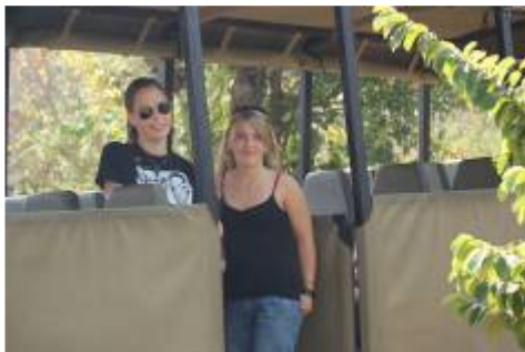
Getting ready to go on the Safari Jeep!