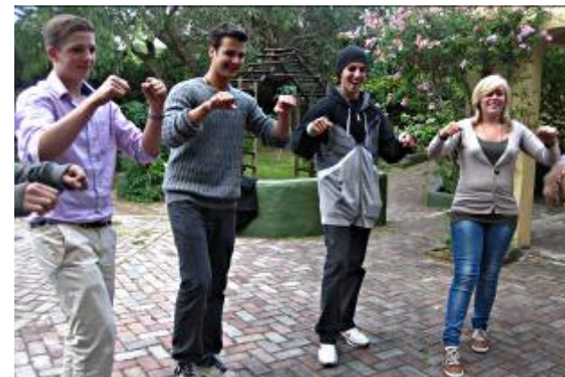
Students doing their tribal dance