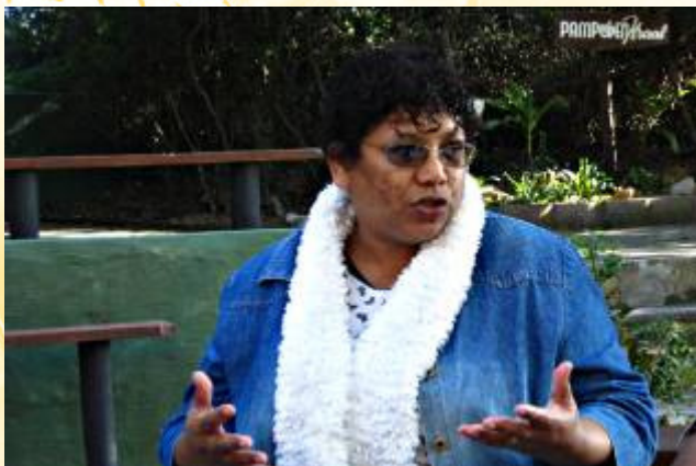
Post-Arrival Orientation 2010