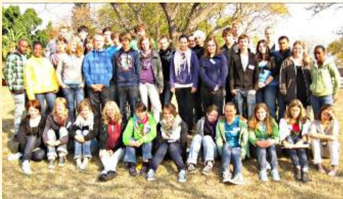
Post-Arrival Orientation in Gauteng

To all our foreign students (either on the academic or the volunteer YFU programme) from Brazil, Denmark, Germany, Norway, Belgium France, Chile and Switzerland, a very warm welcome to all of you!