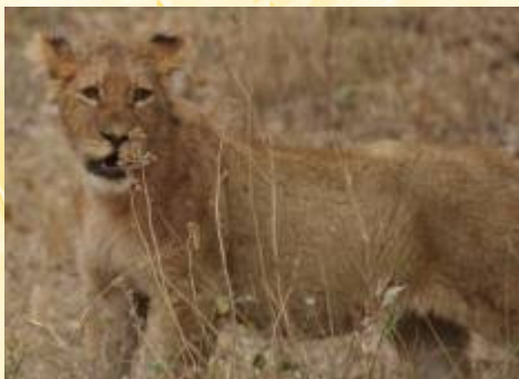
Safari in the Kruger Park! Lions aplenty...