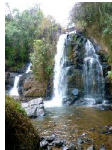
Beautiful nature in Mpumalanga Province